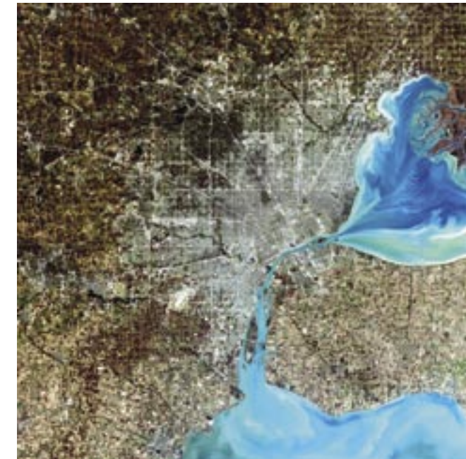
Enhanced true-color satellite image of Detroit.

Community Impact: DDP's activities have resulted in the availability of an online data-sharing tool which allows community stakeholders to share and apply community data for decision-making.